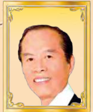
YB DATUK TIONG THAI KING DUN N.52 DUDONG