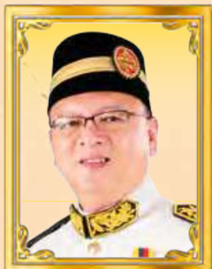
YB IR LO KHERE CHIANG N.13 BATU KITANG