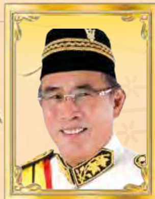
YB DATU HAJI LEN TALIF SALLEH DUN N.41 KUALA RAJANG