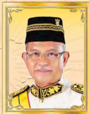
YB DATUK HAJI TALIB BIN ZULPILIP DUN N.67 JEPAK