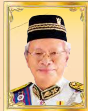
YB TAN SRI DATUK AMAR DR JAMES JEMUT ANAK MASING DUN N.64 BALEH