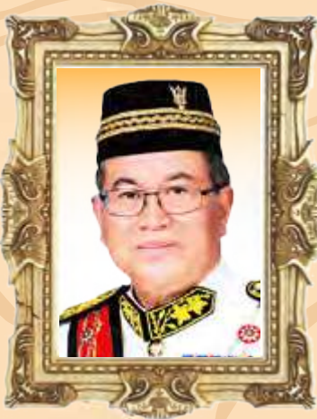
YB DATUK AMAR DOUGLAS UGGAH EMBAS

CHIEF MINISTER MINISTER FOR FINANCE AND ECONOMIC PLANNING MINISTER FOR URBAN DEVELOPMENT AND NATURAL RESOURCES