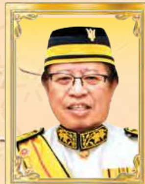
YAB DATUK PATINGGI (DR) ABANG HAJI ABDUL RAHMAN ZOHARI BIN TUN DATUK ABANG HAJI OPENG N.8 SATOK