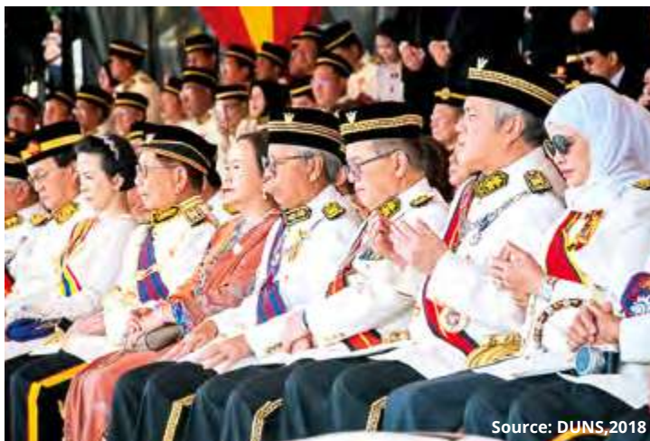
Source: DUNS, 2018