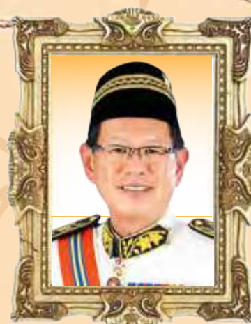
YB DATUK LEE KIM SHIN

MINISTER FOR TOURISM, ARTS AND CULTURE MINISTER FOR YOUTH AND SPORTS