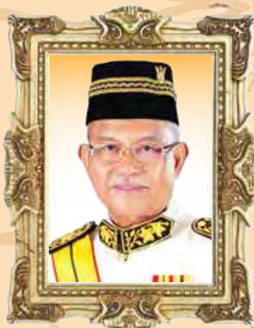
YB DATUK HAJI TALIB BIN ZULPILIP

P.N.B.S., P.J.N., A.B.S. MINISTER FOR UTILITIES