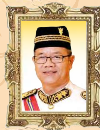
YB DATUK LIWAN LAGANG