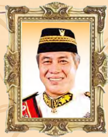
YB DATUK AMAR HAJI AWANG TENGAH BIN ALI HASSAN

DEPUTY CHIEF MINISTER MINISTER FOR INFRASTRUCTURE & PORTS DEVELOPMENT