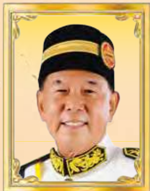
YB DATUK SEBASTIAN TING CHIEW YEW DUN N.73 PIASAU