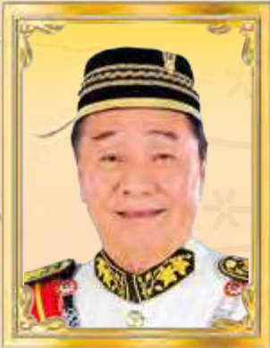
YB DATO SRI WONG SOON KOH DUN N.53 BAWANG ASSAN