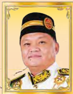
YB DATO' SRI HUANG TIONG SII DUN N.45 REPOK