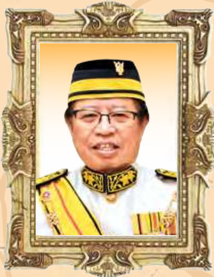
YANG AMAT BERTHORMAT DATUK PATINGGI (DR) ABANG HAJI ABDUL RAHMAN ZOHARI BIN TUN DATUK ABANG HAJI OPENG