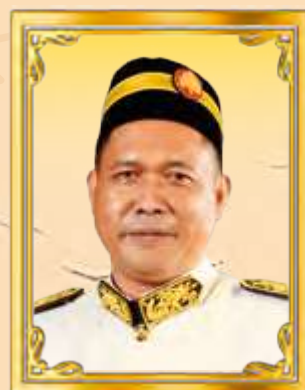
YB IR AIDEL BIN LARIWOO N.24 SADONG JAYA