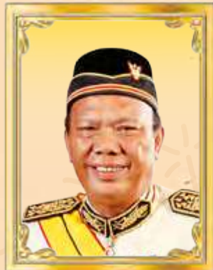
YB DATUK AMBROSE BLIKAU ANAK ENTURAN DUN N.62 KATIBAS