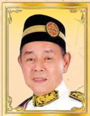
YB DATUK DING KUONG HIING DUN N.46 MERADONG